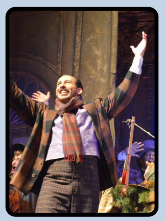
SCHAUNARD IN BOHÈME

In the Fall of 2023, I made two role debuts in two cities with personal significance. I joined Penn Square Opera in Lancaster, PA (my hometown) to sing Bartolo in Il barbiere di Siviglia . This was a fun '80s-sitcom-themed production that featured two other alumni from my alma mater, Wichita State.